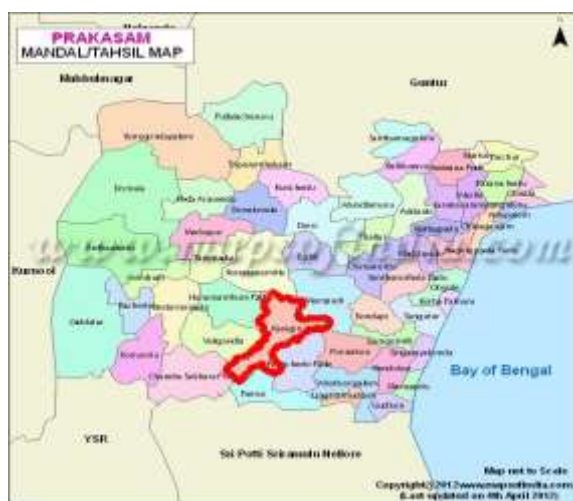
Fig1: Location map

The study area covers Kanigiri mandel. Fig1 showing the location of the area. Water sampling was carried out at random covering at least one sample in a square kilometer area. Wherever wells and ponds exist in the study area, samples were collected. The drinking water from bore wells were extracted using hand pumps and well water. Samples were collected in clean and sterile one-litre polythene cans and stored in an icebox. Analysis was carried out for pH, electrical conductivity (EC), total dissolved solids(TDS), total hardness (TH), total alkalinity (TA), chlorides (Cl - ), sulfates (SO 4 2- ), nitrates (NO 3 - ) and fluorides (F - ). The analysis for physico-chemical parameters and fluoride in ground and surface water samples was carried out according to the procedure outlined in standard methods. Fluoride (F - ) was determined by SPANDS reagent method.