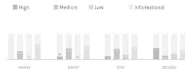
Figure 4. Vulnerabilities Numbers Graph Based On Acunetix WVS Scan Results

Vulnerability scan result from www.xxxxx.ac.id shows 476 warnings with 0 high, 166 medium, 17 low and 293 informational level warnings. While Bakp.xxxxx.ac.id shows 565 warnings with 67 high, 223 medium, 15 low, and 260 informational warnings. Less warning produced from Dewey.xxxxx.ac.id site with total of 93 warnings consist of 31 high, 18 medium, 19 low, and 25 informational warnings. The last site Sim.xxxxx.ac.id shows the lowest of all with 5 high, 32 medium, 10 low, and 40 informational warnings with total of 87 warnings. Details of diagram can be shown in Figure 4.