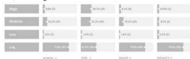
Figure 2. Vulnerabilities Numbers Graph Based On OpenVAS Scan Results

From test result in Figure 2, Dewey.xxxxx.ac.id has 4 high, 3 medium, 2 low, and 28 log vulnerabilities. While Wwww.xxxxx.ac.id has 7 high, 19 medium, 2 low, and 97 log vulnerabilities. Bakp.xxxxx.ac.id has 8 high, 19 medium, 2 low, 96 log vulnerabilities. The last one is Sim.xxxxx.ac.id has the most vulnerabilities with numbers 19 high, 16 medium, 2 low, and 29 log vulnerabilities.