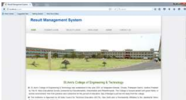
Figure 1: Home page