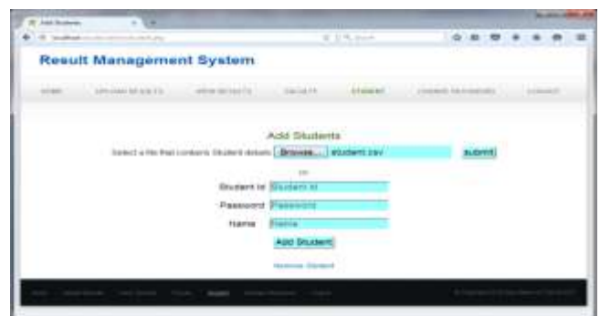
Figure 9: Add students page