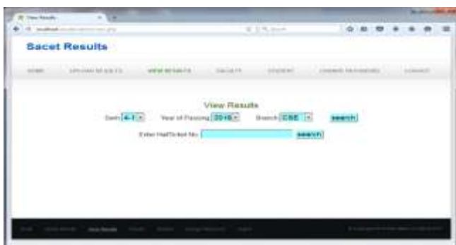
Figure 6: View results page