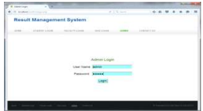
Figure 2: Admin login page