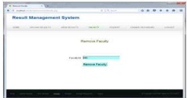
Figure 8: Remove faculty page