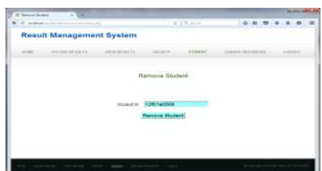
Figure 10: Remove students page