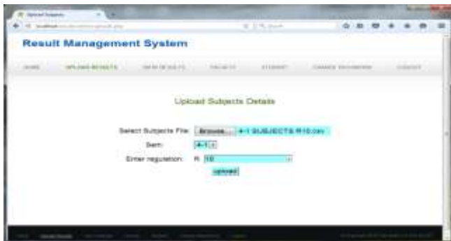
Figure 5: Upload subjects page