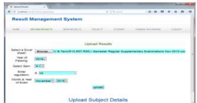
Figure 4: Upload results page