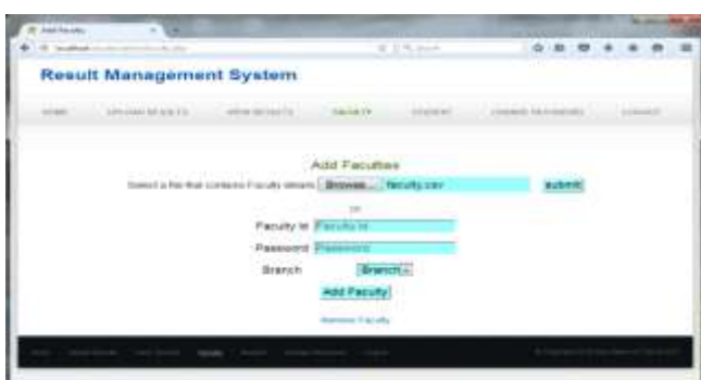
Figure 7: Add faculty page