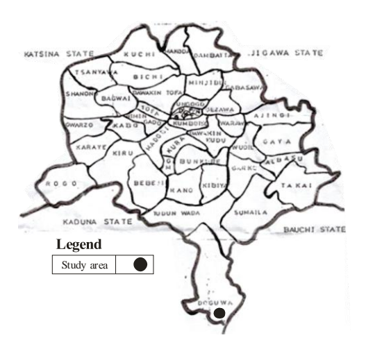
Fig. 1: Map of Kano State Showing the study area

them at a regulated temperature of 55^{0}c for 48 hours. After drying, a series of mesh size 35\mu m was used to remove large undesirable particle sizes The dry test samples were analyzed using the energy dispersive X-ray florescence (EDXRF) FXL-83358 model to determine the concentration of the metals in the soil samples.